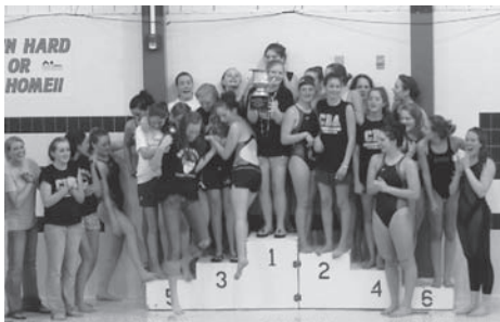
The CBA Girls Swimming and Diving team climbs the podium to accept the Section III Overall Team Championship trophy.

The CBA Girls Swimming and Diving team completed an undefeated season and won the Section III Overall Championship for the first time in school history, scoring 397.2 points, nearly 100 points higher than the second place finisher. Seven different members of the CBA team won individual Section III championships in the following events, and moved on to compete in the NYSPHSAA State Meet in Buffalo: