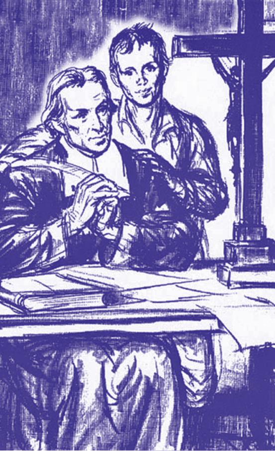
[ St. John Baptist de La Salle with a student ]