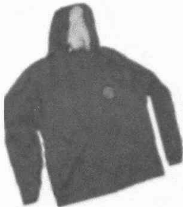
Pocket Jacket $45