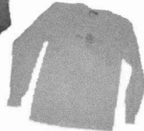
Long $18 Short $12