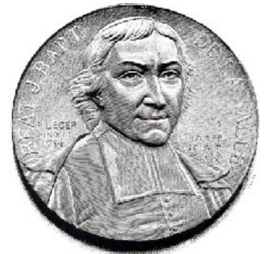
JEAN-BAPTISTE DE LA SALLE